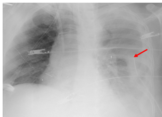
Figure 3: Chest x ray of the patient after left anterior chest tube (red arrow) was placed for drainage of the left hemothorax.

Tube thoracotomy was done the next day (Figure 3) by the cardiovascular team, draining around 2500 ml of blood in the first 24 hours. Afterward, the amount of blood being drained decreased spontaneously to around 100ml/24 h and remained like that. Unfortunately, our patient developed severe septic shock due to Acinetobacter Baumannii multidrug-resistant (MDR) pneumonia that led to his demise.