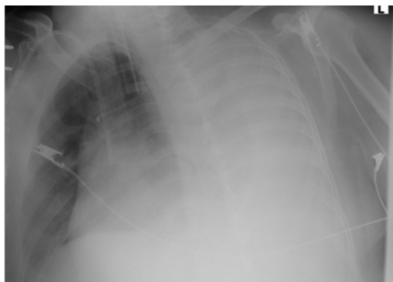
Figure 2: Chest x-ray of the patient 24 hours after of the removal of the left subclavian venous catheter removal showing a large pleural effusion.

Follow-up laboratory findings showed a severe drop in hemoglobin level from 9.2 mg/dl the day the central line was removed to 5.8 mg/dl 24 hours later. Initially, Disseminated Intravascular Coagulation (DIC) was ruled out since no thrombocytopenia and no elevated fibrinogen level. Two blood units were transfused. A chest X-ray performed the day after showed a left white lung (Figure 2). Diagnostic pleural tap drained blood as pleural fluid studies showed: a red blood cell count (RBC) of 2,200,000/microliter with an Hct of 21 % and white blood cell count (WBC) of 4200/microliter, which was similar to the patient CBC with pleural Hct/blood Hct > 90%.