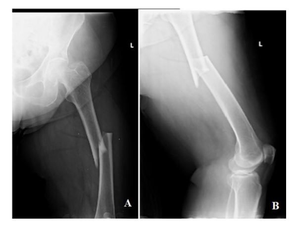
Figure 2: Plain radiographs of the left femur (A) Antero-posterior view showing a midshaft spiral fracture with displacement and (B) lateral view further showing the fracture pattern.

An X-ray of both femurs was done in the emergency department and they showed a spiral complex fracture of the mid-femoral shaft of the left femur (Figure 2).