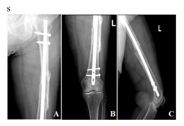
Figure 4: Radiographs of the left femur in the (A, B) Antero-posterior and (C) lateral views done 3 months post operatively showing the intramedullary nail in place stabilizing a healing fracture. A callus is noted with adequate alignment.

strength [10,14,15]. The prolonged usage of bisphosphonate can cause a higher suppression of bone turnover and thus an increase in skeletal fragility and fractures in patients may result [3,6,16].