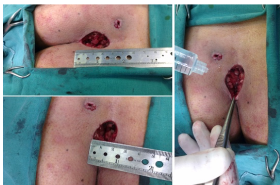
Figure 2: Intraoperative measurements (length, width and volume).