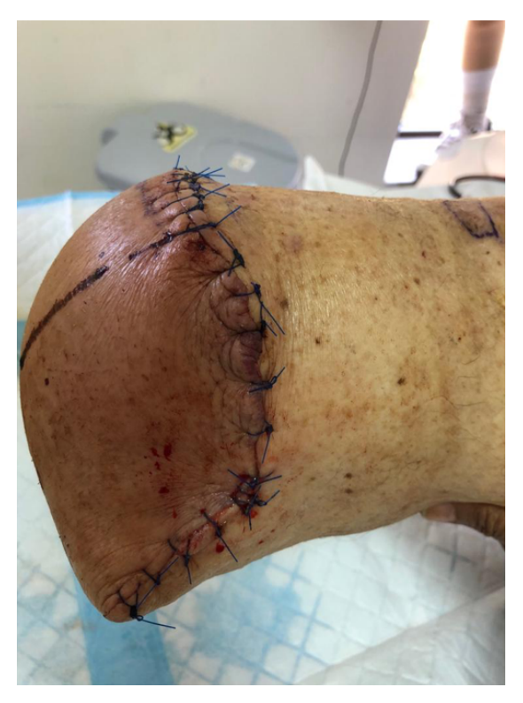
Figure 4: Post below-knee amputation

Our case presentation is yet another rare documentation of the life-threatening condition known as type IV necrotizing fasciitis, or fungus-induced necrotizing fasciitis. This subcategory re-mains a rare entity that is seldom seen and often misdiagnosed initially. Type l is the polymicro-bial entity, type II is the monomicrobial presentation and type III is the gas gangrene caused by clostridium perfrengens [4,5]. And despite the fact that this type IV has a similar clinical presentation as type II, caused by streptococcus group A or staphylococcus aureus species, it is far more deadly in terms of morbidity, mortality as well as treatment difficulty, and side effects [3,4].