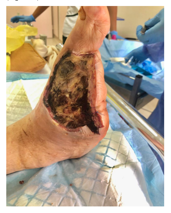
Figure 2: Recurrence of necrosis after ankle-sparing

surgical consults. The patient was immediately started on meropenem 1g intravenously (IV) every 8 hours and vancomycin 20mg/kg once followed by 15mg/kg every 12 hours. An urgent surgical consult was ordered with a recommendation urgent below-the-knee amputation, of above all areas of noted swelling and inflammation. The patient was examined by the surgical team and based on the patient's wishes, he underwent an ankle-sparing excessive debridement with transmetatarsal amputation and removal of all the necrotic tissue. Throughout the night, the patient continued to have low-grade fever spikes. The next day, upon dressing change, recurrence of the non-oozing, non-bleeding necrotic areas was noted. Wound cultures were taken. and another extensive debridement was performed, as the patient did not give consent for a below-knee amputation. On the third day, the wound dressing again showed a recurrence of the necrosis (Figure 2). The microbiology lab reported a positive culture that grew molds on Sabouraud Dextrose agar, with a slide preparation showing molds with wide caliber hyphae, large spores, and wide-angle branches, identified as mucormycosis (Figure 3).